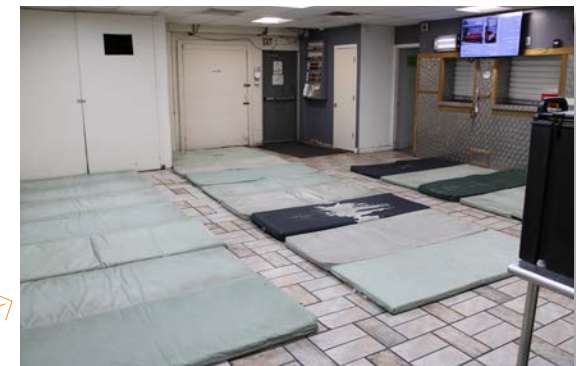
Sleeping mats replace the cafeteria tables every night.

These numbers are staggering, and we feel their weight daily.